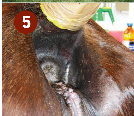
5 — A defective perineum usually shows excessive forward tilting of the vulva and predisposes to pneumovagina.