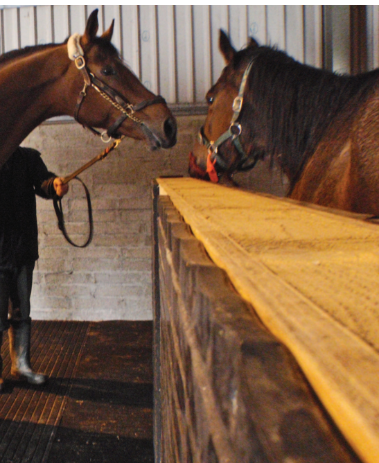
1 — Stallion at the teasing board getting ready for collection.