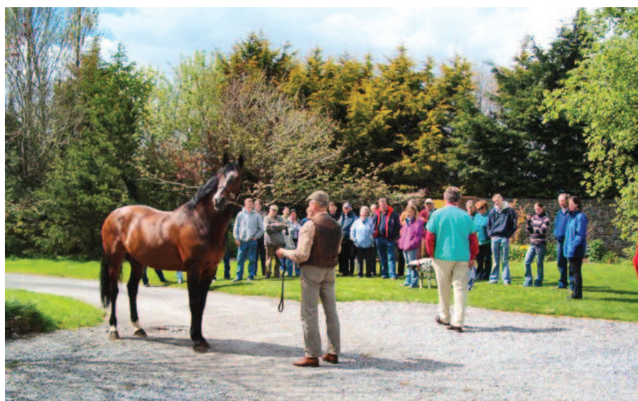
Breeder discussion group members can learn something from each other and everyone will take away some piece of information from a meeting or farm visit.

Over the past two years they have organised various meetings, ranging from farm visits to educational talks on nutrition, health, hoof care, fertility and reproduction. They have held courses on basic handling of young stock together with preparing animals for the show ring. The group organised a handlers'