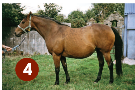
4 — Mares suffering from Metabolic Syndrome usually present with a crested neck, laminitis and reproductive disorders.