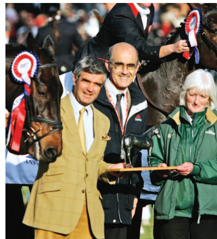
ABOVE: Irish Sport Horse Studbook receiving the Leading Studbook Award at Le Lion d'Angers 2010.

These strong performances from Irish Sport Horses meant that the Stud-