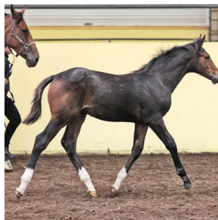
Arko III foal