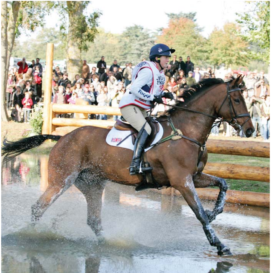
Piggy French and Killealy Brief at Le Lion d'Angers 2011.