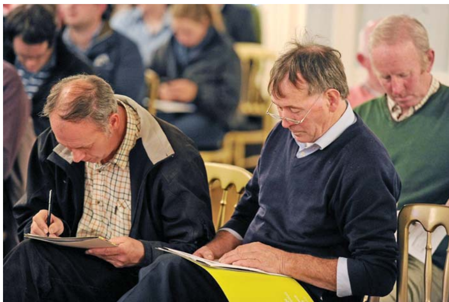
Hard at work.