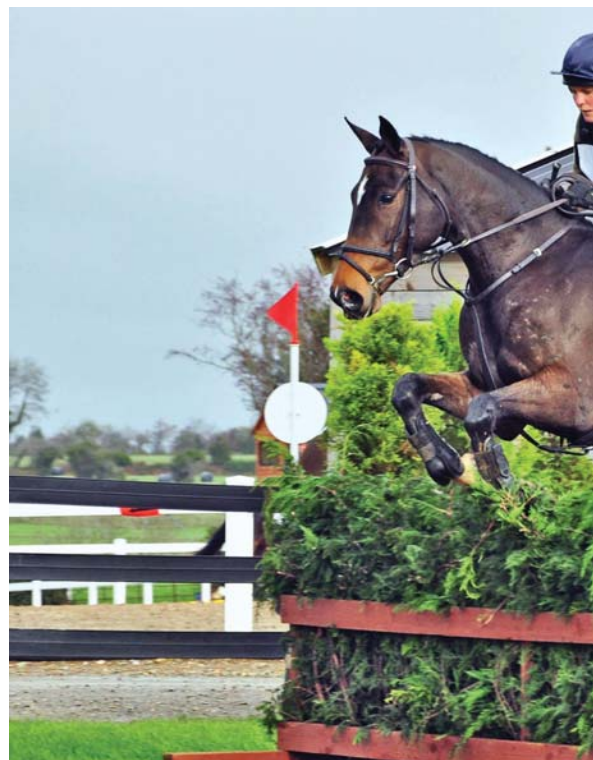
Lot 7 'Bashful Prince'