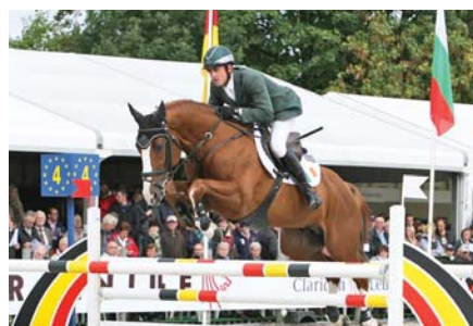
Oldtown KC at Lanaken.

The championships are run over four days of competition, with qualifying classes taking place on the first two days. The Saturday of the show sees the consolation classes taking place, for those horses that have not managed to qualify for Sunday's finals. Then on Sunday morning, in the main arena, the three World Championship Finals