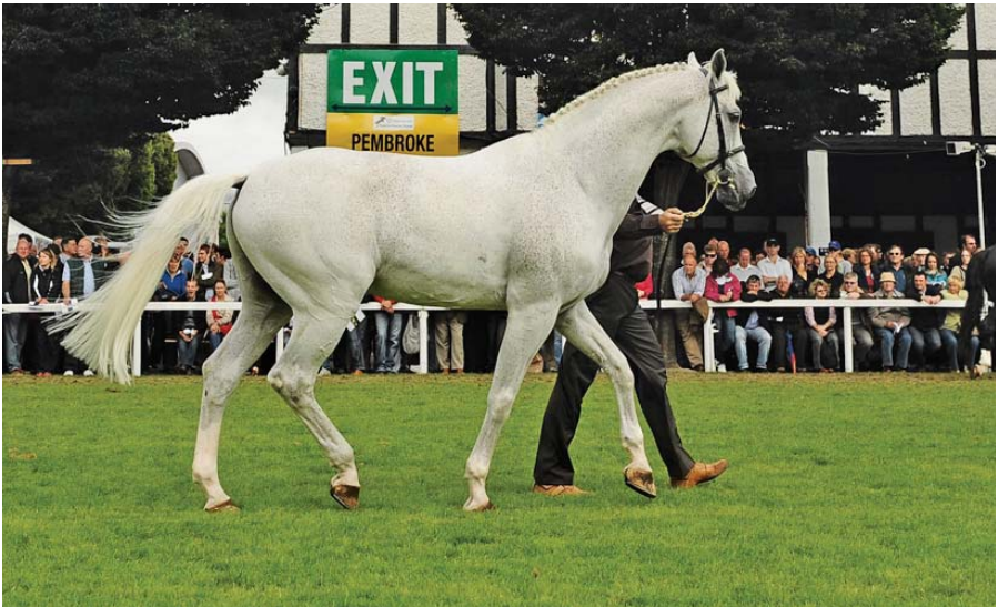
Heritage Fortunus (HANN)