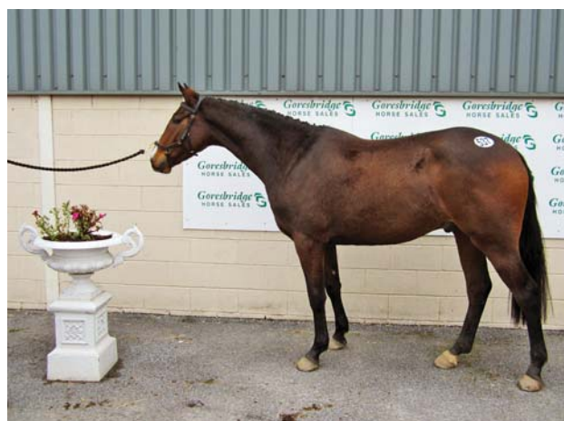
Lot 537 'Master Imp' 3yo