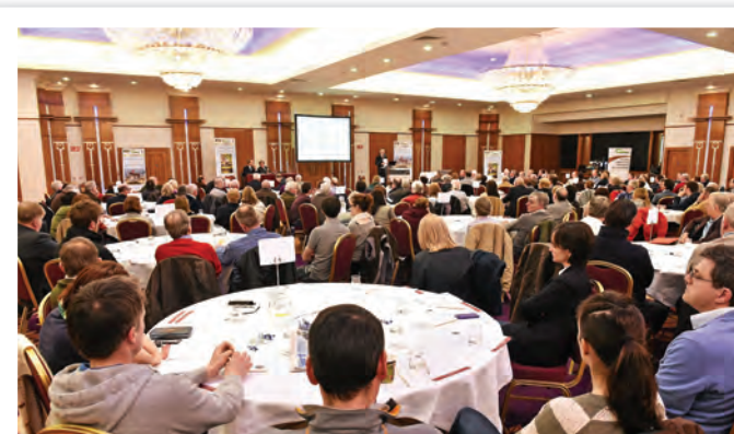
A large crowd attends the Regional Meeting at Knightsbrook Hotel, Trim, Co. Meath on 26th March.

Submissions outlining suggestions under the following headings to aid the development of this strategy are also being sought: Breeding & Production, Marketing, Institutional Support & Policy, Knowledge Transfer & Training. Submissions should be forwarded to submissions@sporthorsestrategy.ie or by post to Sport Horse Strategy Committee, Teagasc, Mellows Campus, Athenry, Co. Galway by 5pm on Friday 2nd May 2014 . For more information, visit www.sporthorsestrategy.ie