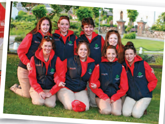
The ISH Young Breeders Team at the International Young Breeders Competition in Sweden, 2013.

discussion of markets; practical stable management and husbandry; and indeed there may well be a visit to a very well respected thoroughbred breeding and production facility later on in the year. The aim is always to engage with the very best in the industry and offer young people every opportunity to have open discussion and opportunities to learn from these individuals.