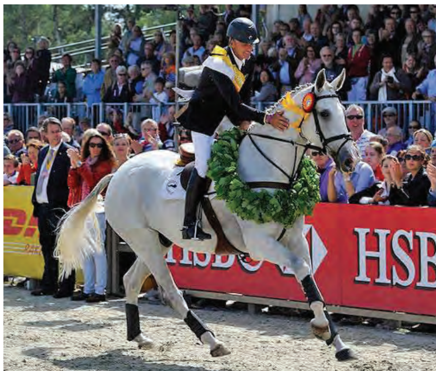
Left and above: Mr Cruise Control (ISH) & Andrew Nicholson (NZL) in winning form at Luhmühlen 2013