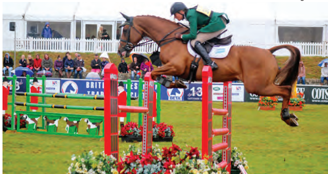
Fenya's Elegance in action.