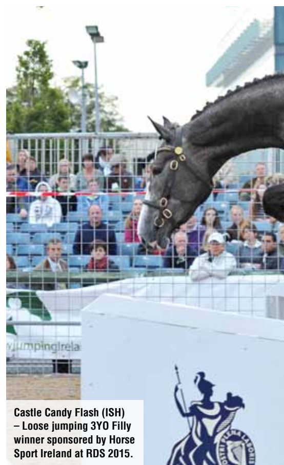
Castle Candy Flash (ISH) – Loose jumping 3YO Filly winner sponsored by Horse Sport Ireland at RDS 2015.