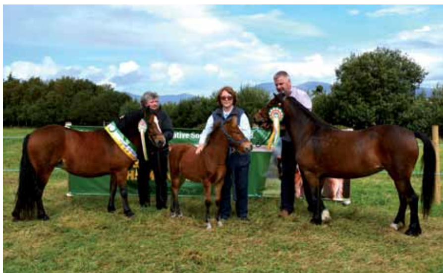
Champion: Ventry Height, By Ventry Dreamer, out of Bog Realin (Foal by Ceide Fields), Reserve Champion: Hot Bunny, By Quagmire Jasper, out of Hot Blondie

Building on this success, this year's Championship is being sponsored by Horse Sport Ireland and run through the Irish Shows Association. In total there will be 9 qualifiers this year, with the Final being at the National Show and Sale in Glenbeigh on 22nd August. It is hoped that this championship will become an incentive for breeders and