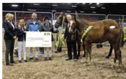
Champion Eventing Colt Foal 2015 – Ballylough Bewell (TIH) by Clerkenwell (USA) (TB) out of Bellville Diamond (ISH) by Flagmount Diamond (ID). Owner: Malachy & Nuala O'Hare