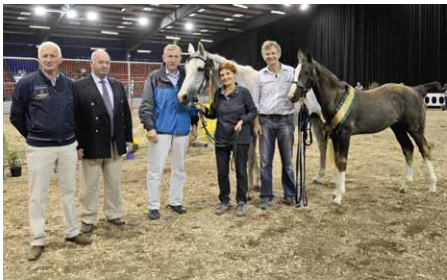
Champion Show Jumping Colt Foal 2015 – Cassidy (KWPN) by VDL Bubalu (KWPN) out of Vamp (KWPN) out of Colino (HOLST). Owner: Andries De Bont