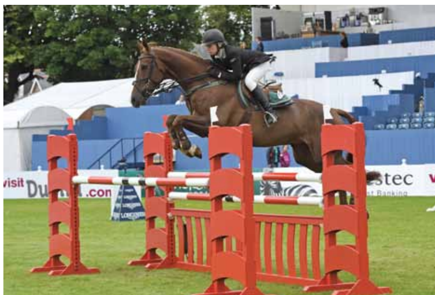
RVS Lui Fortunus (ISH) winner of the 5 Year Old National Jumping Championship sponsored by HSI.