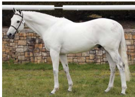
CENTENNIAL (IRE) (TB) (Approved)

Upgraded to Approved in the ISH Studbook having met the timeform criteria.