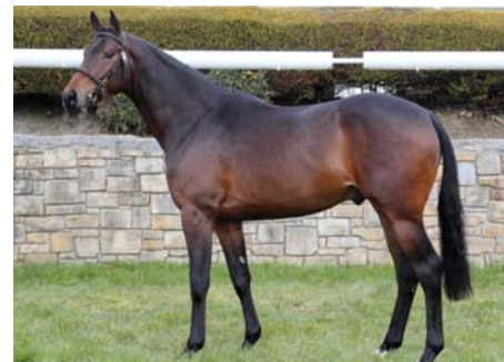
JACK THE ROBIN (IRE) (TB) (Approved)

Upgraded to Approved in the ISH Studbook having met the timeform criteria.