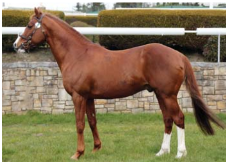
ASCALON (GB) (TB) (Approved)

2004 by Galileo (IRE) (TB) and out of Leaping Flame (IRE) (TB) by Tremolino (USA) (TB).