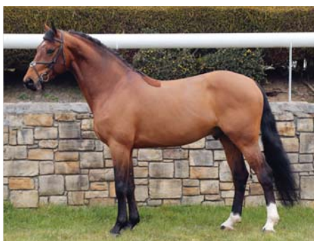
CELTIC HERO B Z (ZANG) (Preliminary Approved)

2012 by Calikot Hero (SBS) and out of Cricket Z (ZANG) by Caretano Z (ZANG).