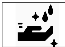
Regular Hand Washing

Please refer to Protocols for Disinfection and Hygiene sport horse activity