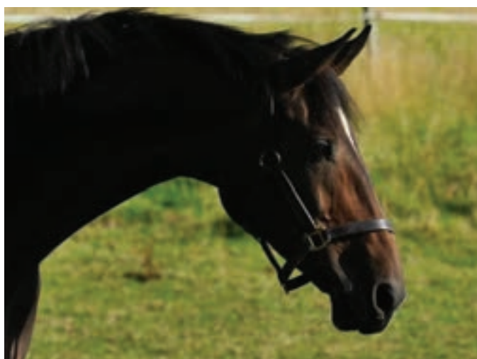
Tullibards Lux Sensational (ISH).

We are looking to breed a commercial horse, to be as nice a breeding as you can possibly have. Blood enough: I know Brookfield Inocent (ISH) was 80% blood, but I've had horses with a whole lot less blood – it just depends on the horse's attitude. We are looking to breed a horse that will be good enough to jump different levels. They nearly have to be a top jumper to be a top eventer. It used to be a failed jumper would go eventing, it's not like that anymore. If they've a good temperament and a good attitude to their job, then you should always be able to sell them.