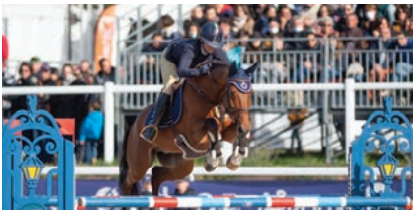
Bonmahon Chelsea (ISH) took third place in the 6-year-old final at the 2021 FEI WBFSH World Breeding Eventing Championships for Young Horses.